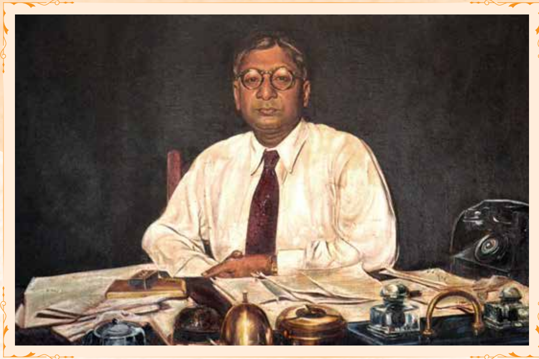
Rai Bahadur Ranada Prasad Shaha (1896-1971)